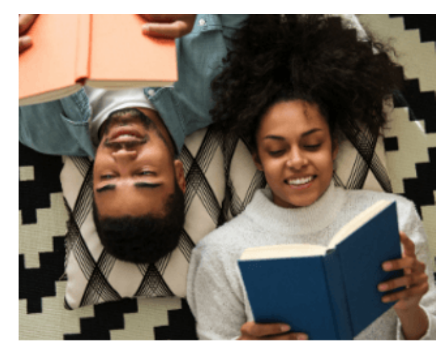
Readers Are Obsessed With This Site BookBub