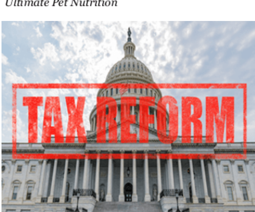
No IRA or 401(k) is Safe: Protect Your Savings Birchgold.com